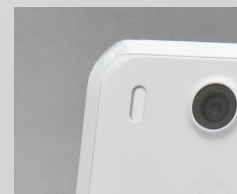
with white IR